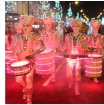
Christmas Wonderland events, helping to attract visitors all year round