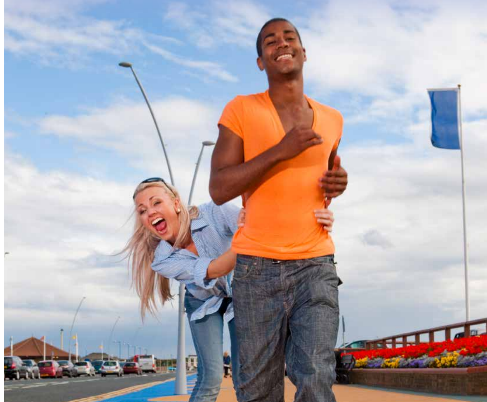
South Shields Seafront