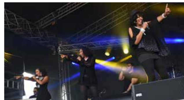
Sister Sledge were one of the well known acts who performed at the South Tyneside Festival 2017

The visitor market is fiercely competitive and many of our near neighbours are investing to improve their visitor offer. We operate in a global market place where the potential visitor is bombarded with ideas for things to do. The visitor offer in South Tyneside is superb and improving all of the time but to stand out from the crowd we must always present our strongest proposition.