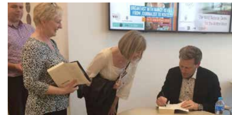
Best selling author David Baldacci at The Word

A successful programme of authors' talks, live performances, children's storytelling and creative sessions are being established at The Word and are already attracting capacity audiences from across the region. We have continued to build on this with the launch of a new writing and performance festival for the North East called WRITE. This will become an annual event and an important part of the regional book, literature and writing festival programme.