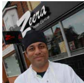
One of the popular Indian restaurants on Ocean Road