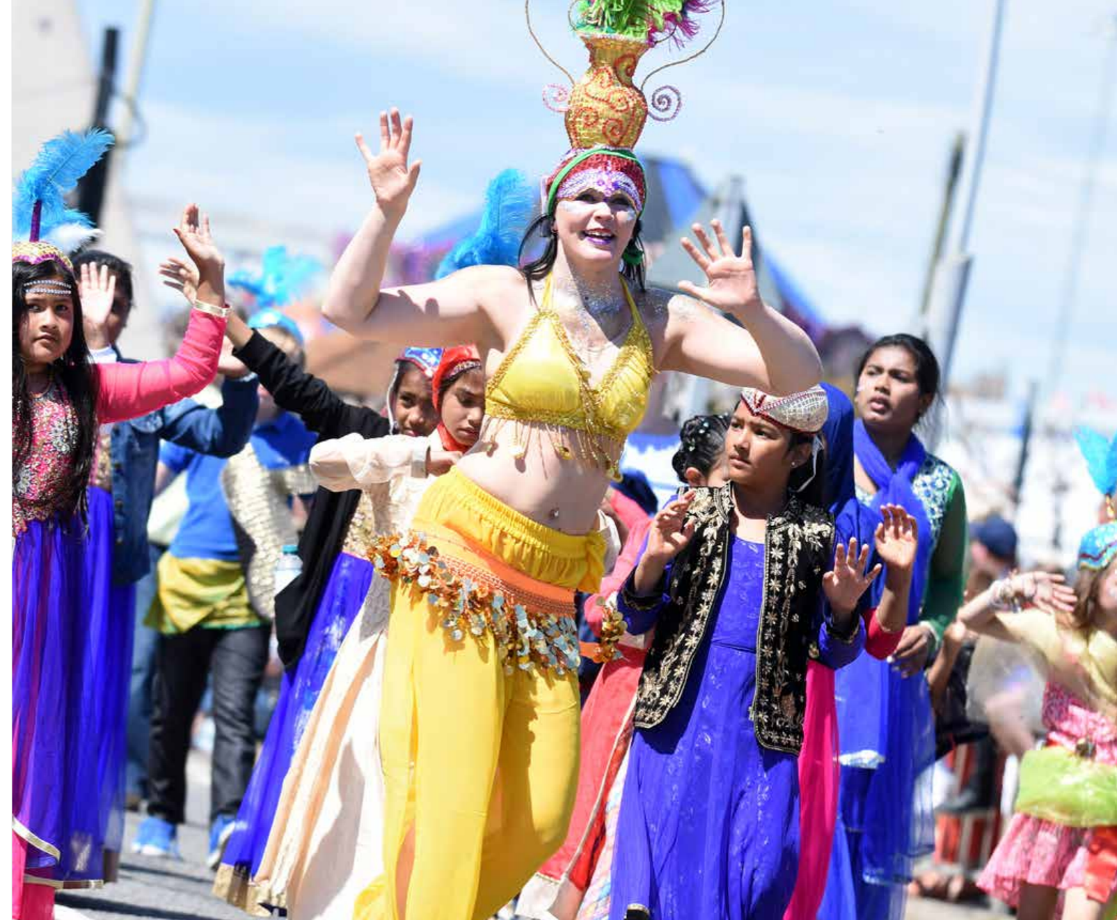
Summer Parade, South Tyneside Festival