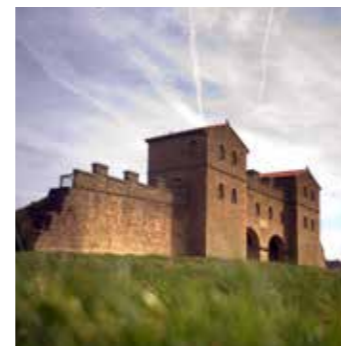
Enhancing attractions such as Arbeia Roman Fort will attract more visitors