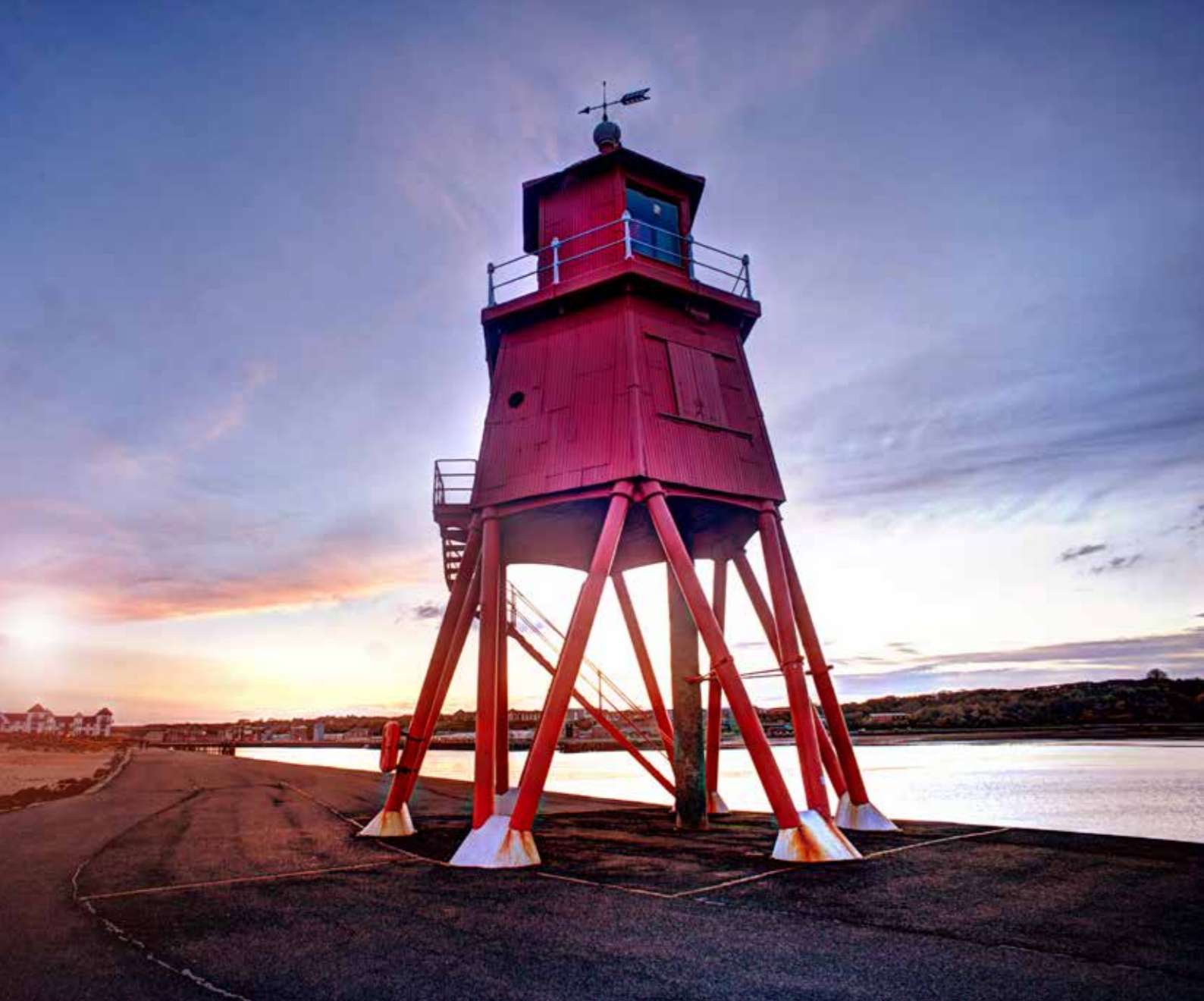
South Shields Groyne Lighthouse