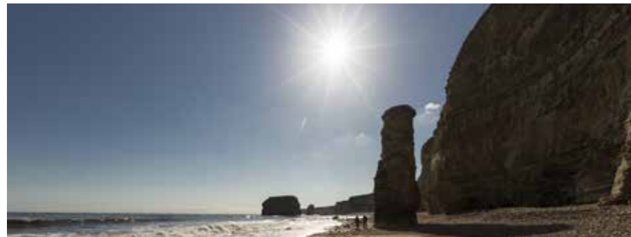
The spectacular coastline at Marsden Bay