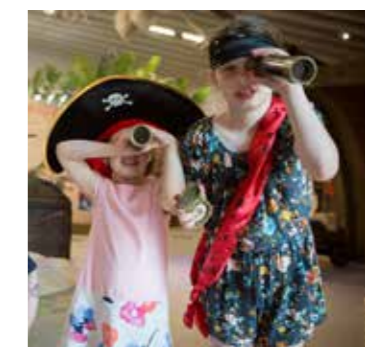
Shiver Me Timbers, The Word