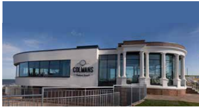
A great food offer