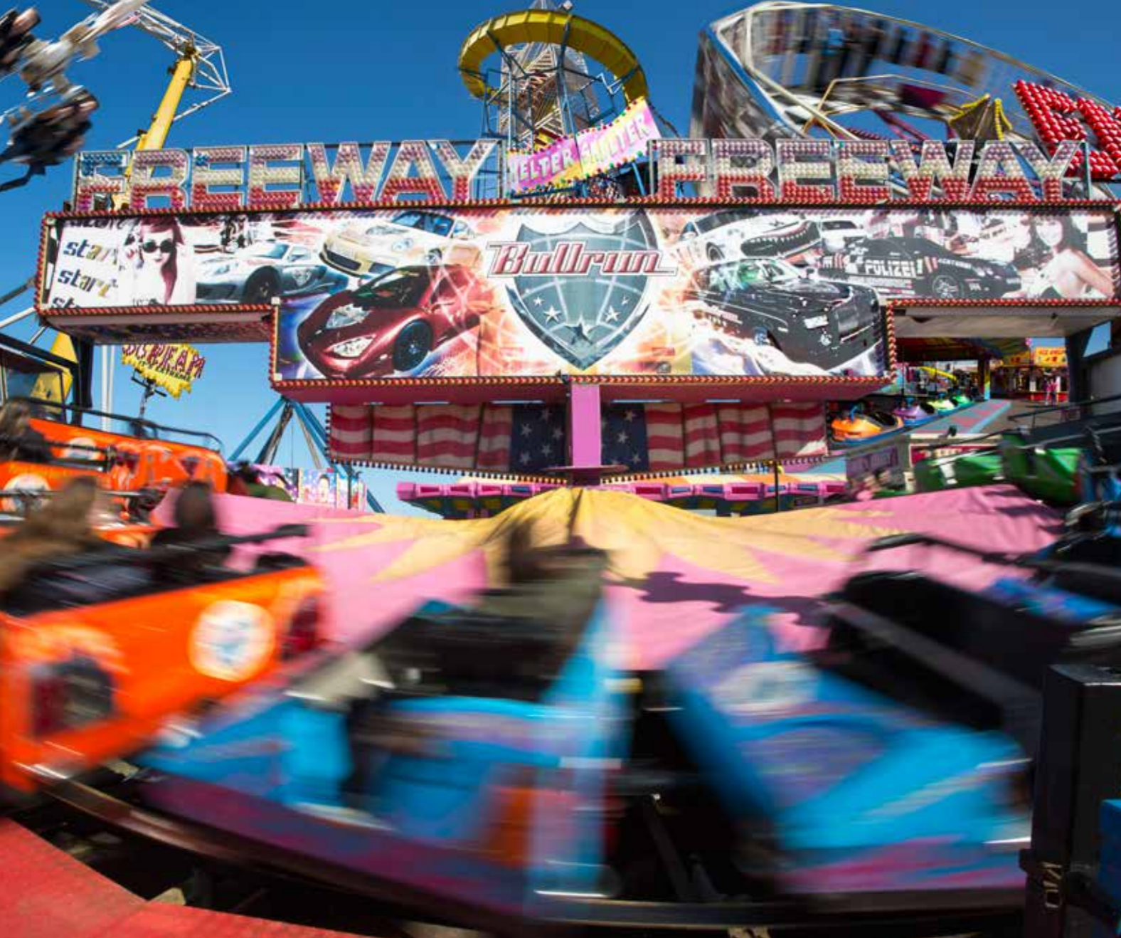
Fun with the family at Ocean Beach Pleasure Park