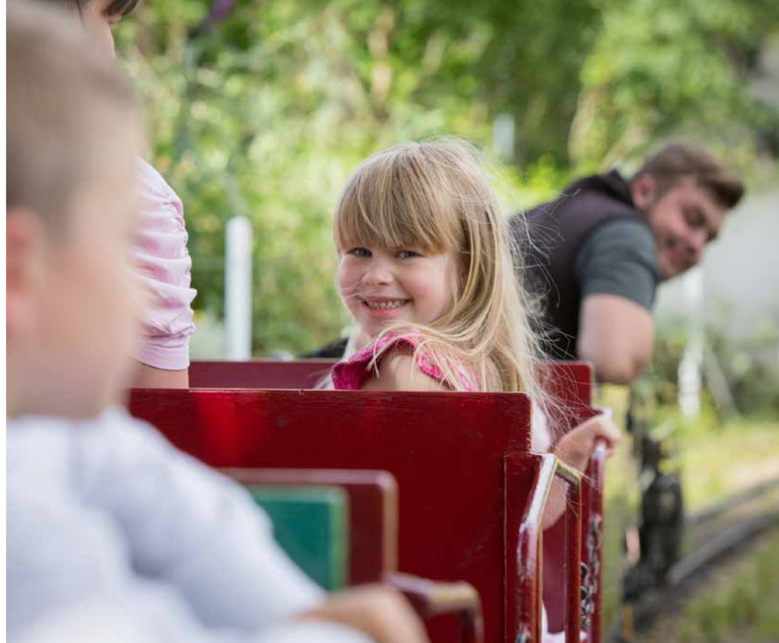
Miniature steam train, South Marine Park

Of course, the area is also well known as the seaside finish of the Great North Run , the greatest half marathon in the world attracting thousands of runners and their families to the area every September and showcasing South Tyneside to millions of people around the country and beyond in televised coverage.