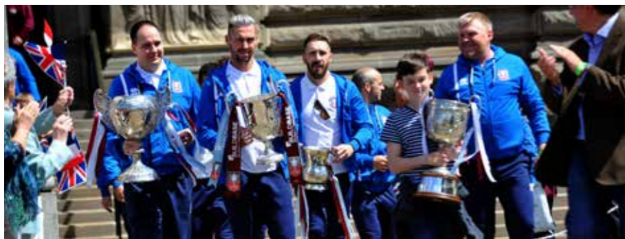
South Shields FC leading the Summer Parade 2017