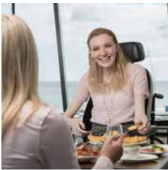
Colmans Seafood Temple