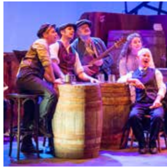
New writing at The Customs House