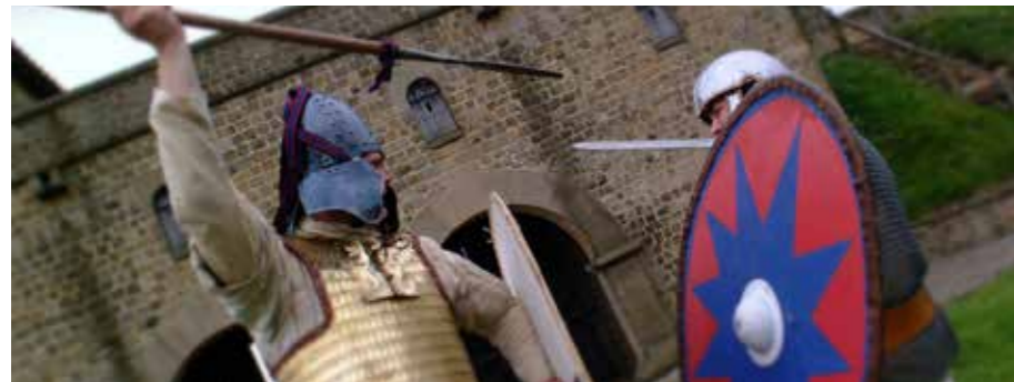
Arbeia Roman Fort