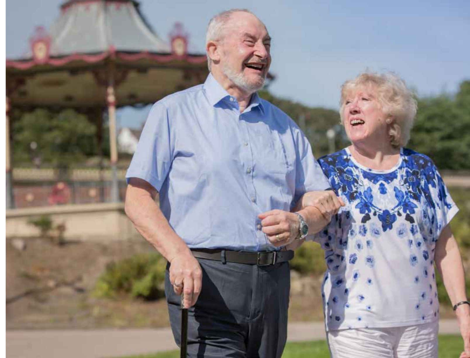
South Marine Park