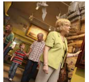
South Shields Museum & Art Gallery