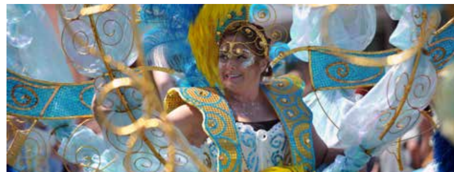
The Summer Parade continues to grow each year