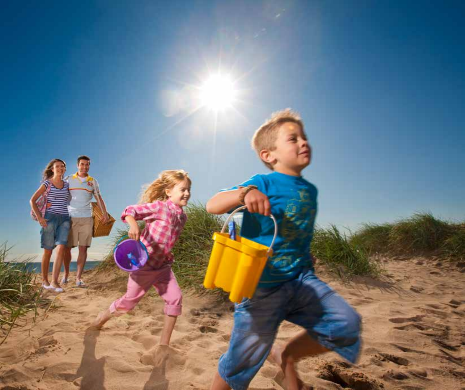
Building sandcastles at Sandhaven Beach