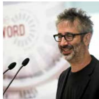
David Baddiel at the opening of The Word