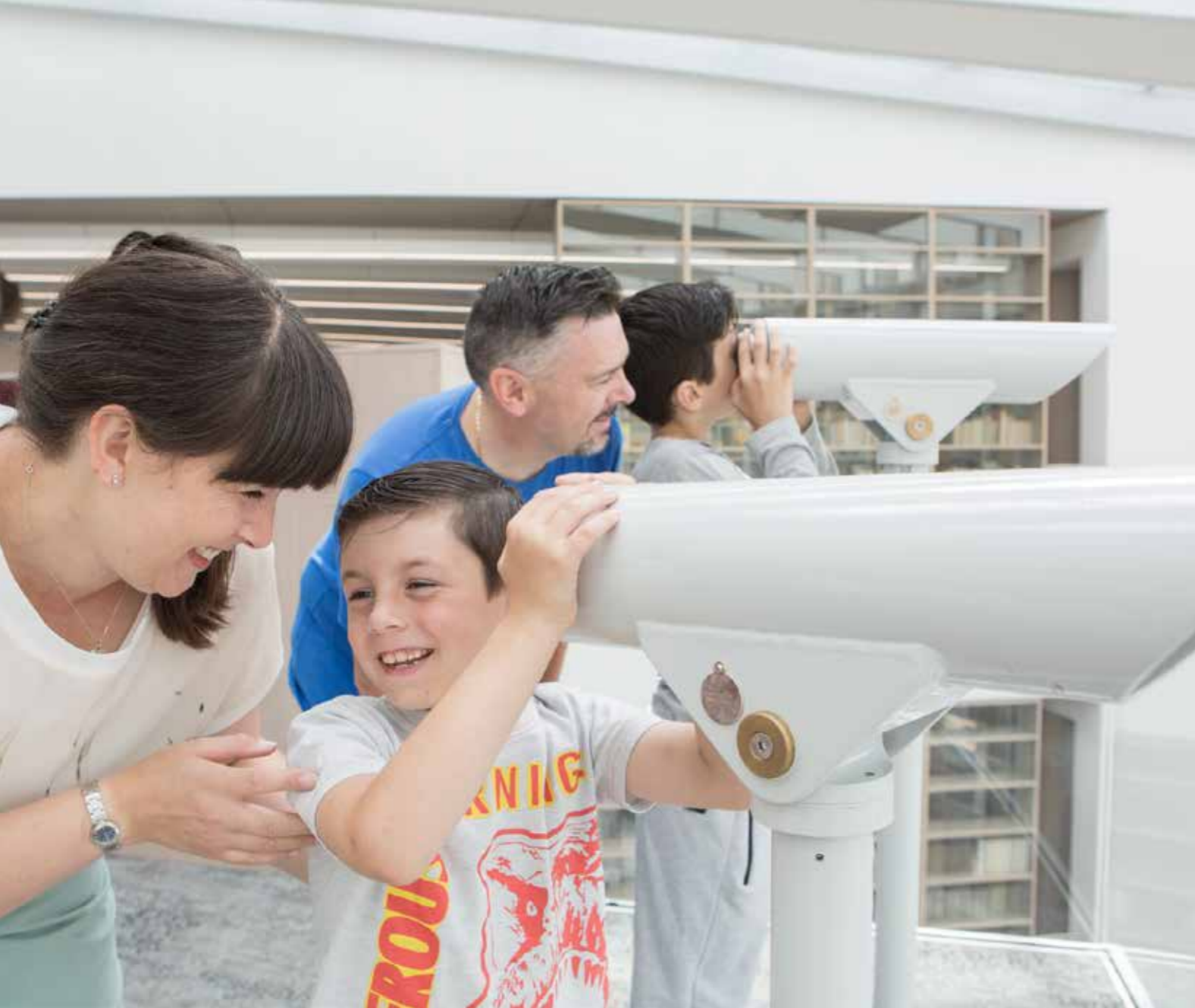
Making memories at The Word