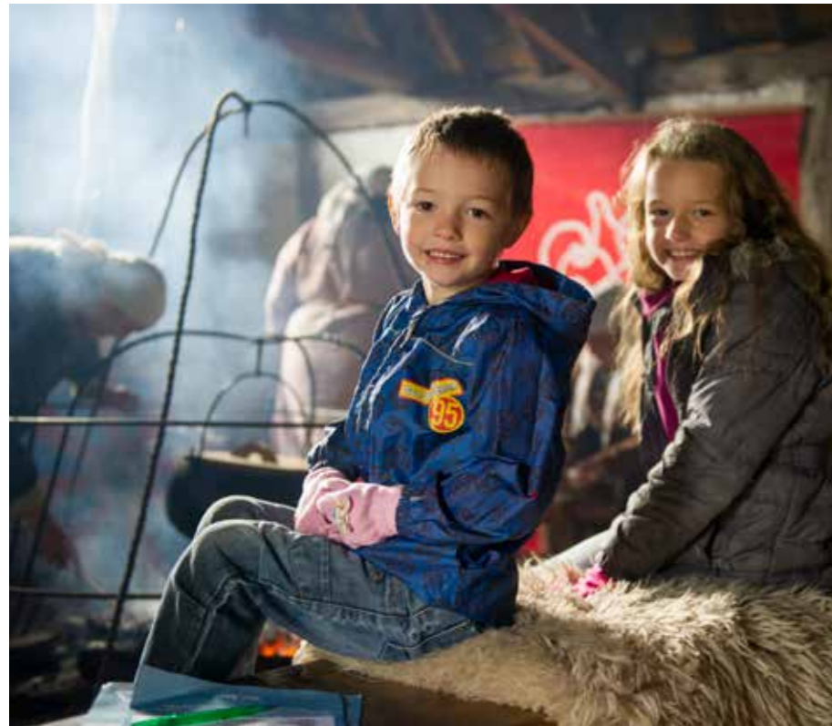
Kids discovering the newly opened Jarrow Hall