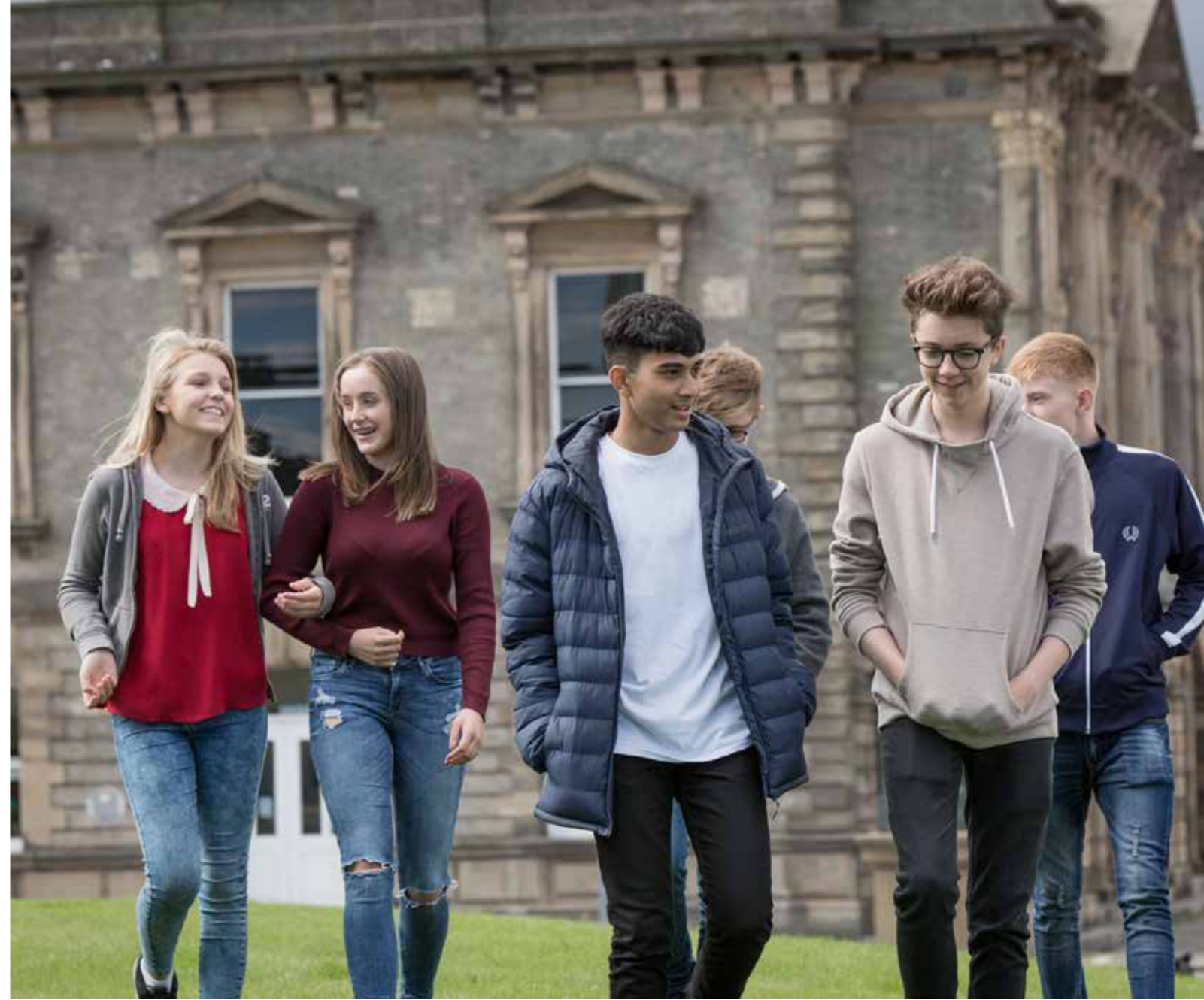
The area has a strong cultural development programme