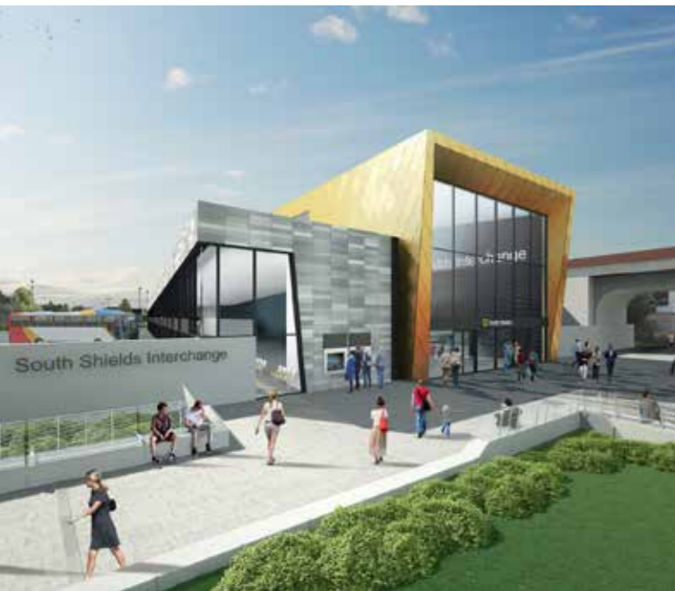
South Shields Transport Interchange