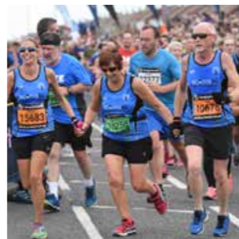
The world famous Great North Run