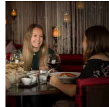
Enjoying a curry with friends