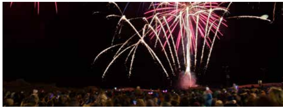
A year round event programme