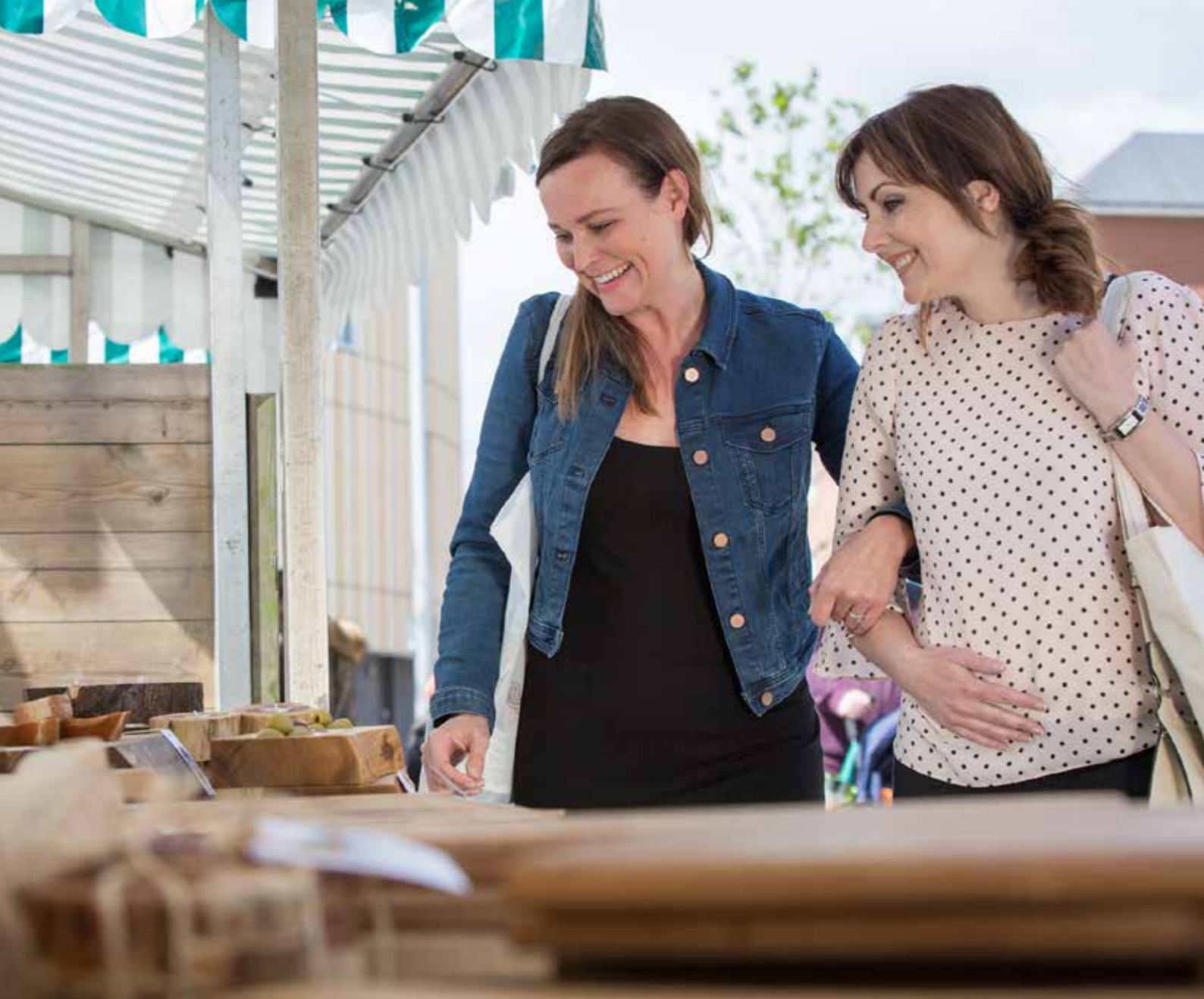
Craft Markets at South Shields