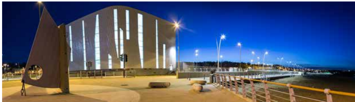
Haven Point and Littlehaven promenade