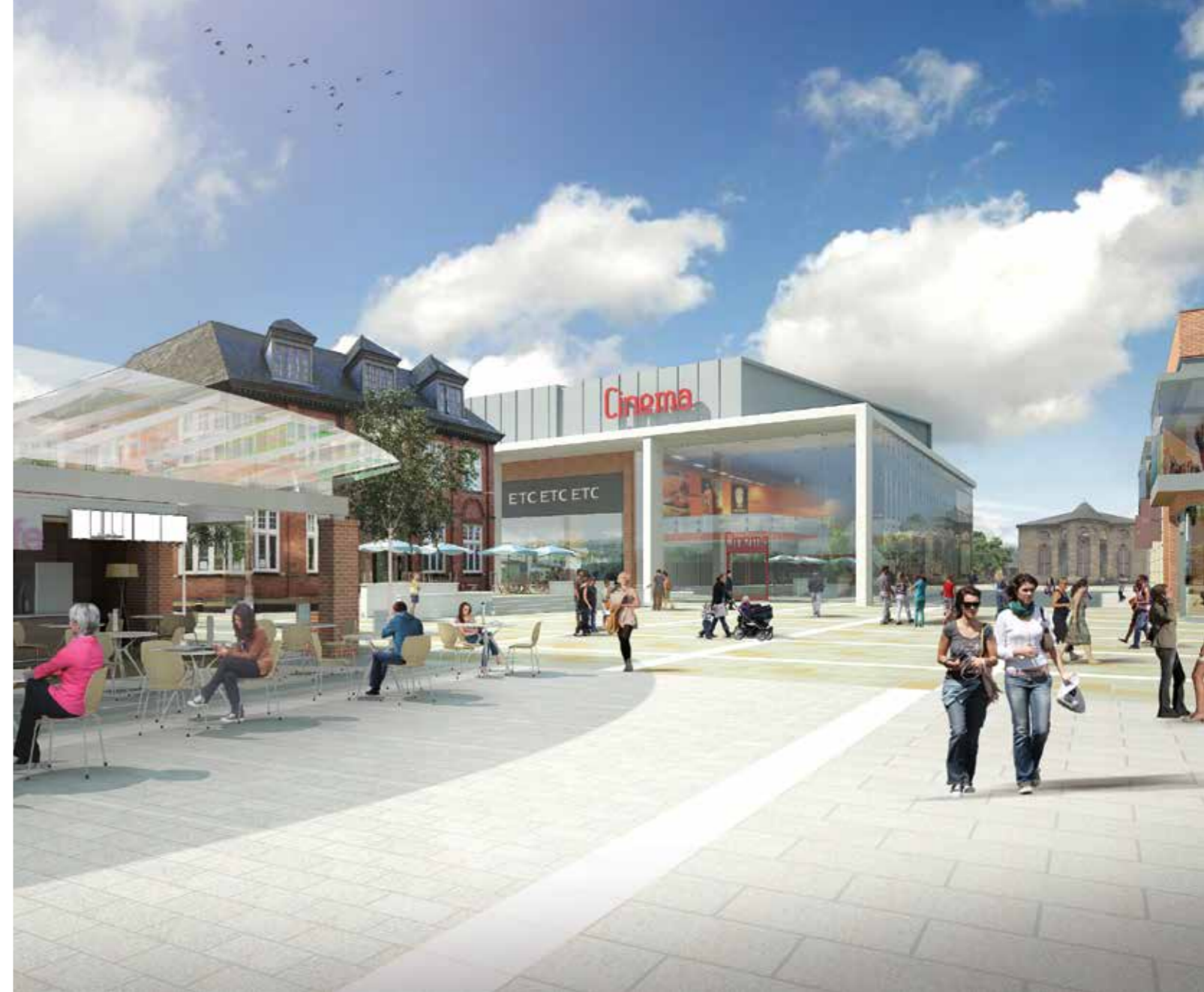
Improved retail offer as part of South Shields 365