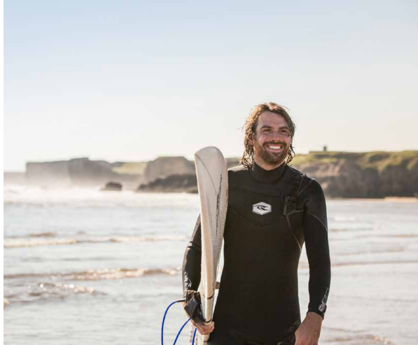
South Shields Surf School