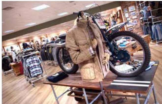
Barbour Factory Outlet Shop