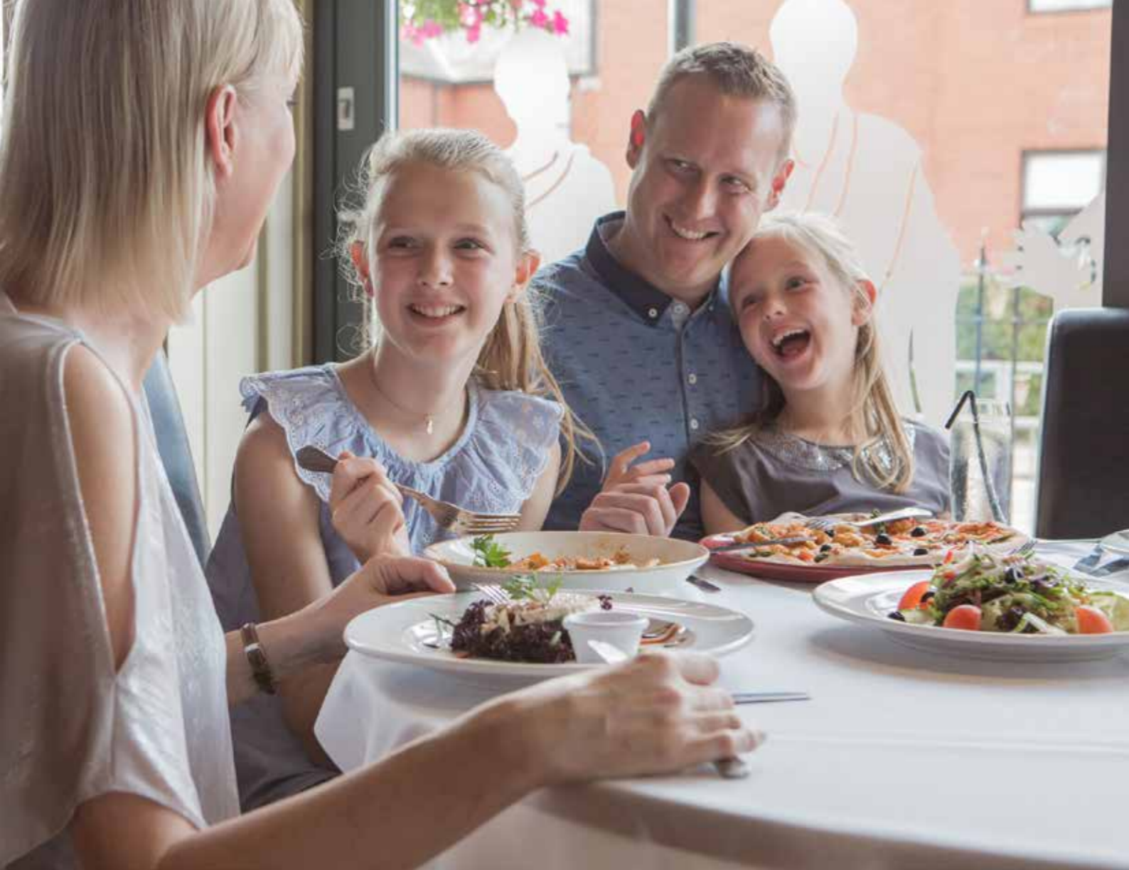
Eating out with the family