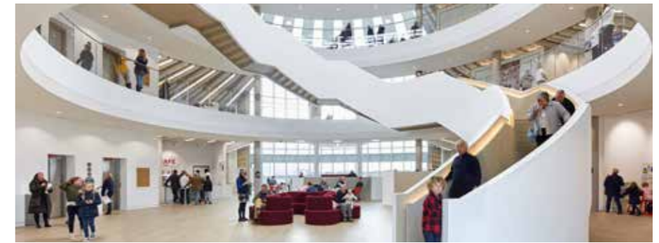
The Word has proved to be hugely popular since it opened and has won numerous awards