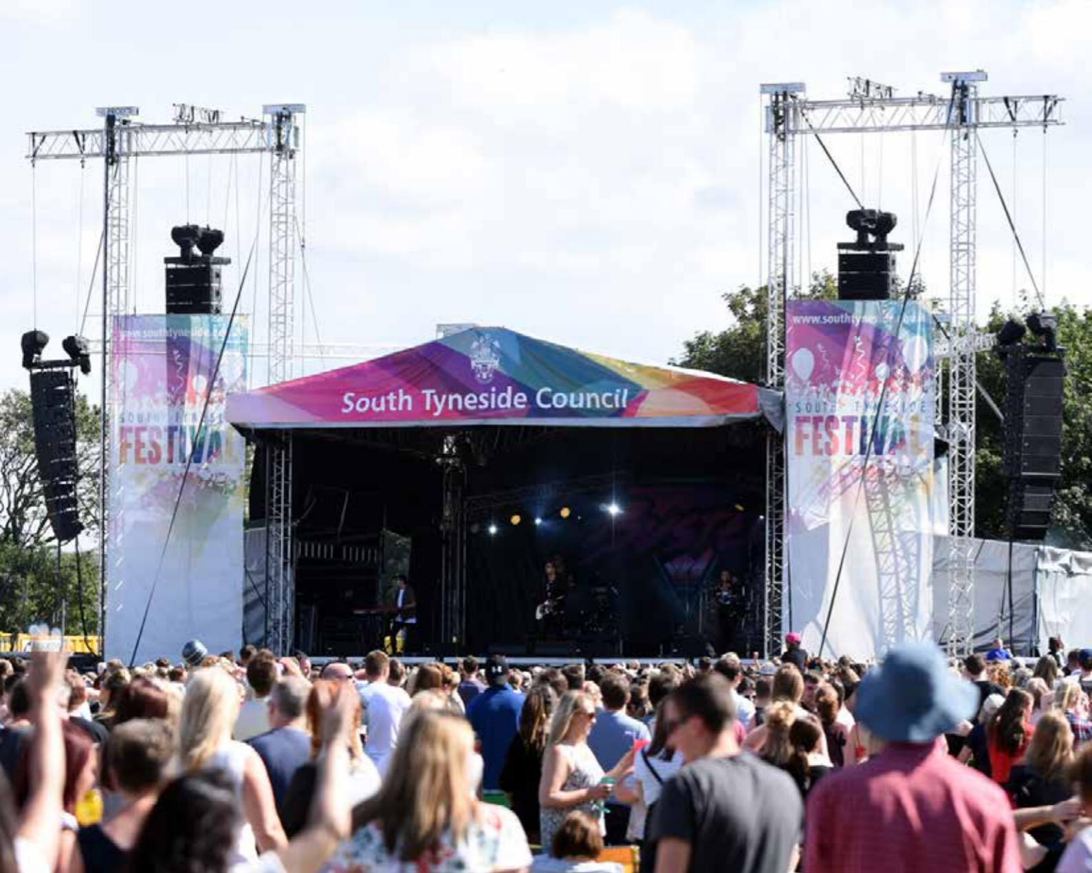
Crowds of 20,000+ regularly enjoy the South Tyneside Festival Sunday Concerts