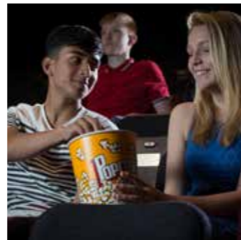
The Customs House